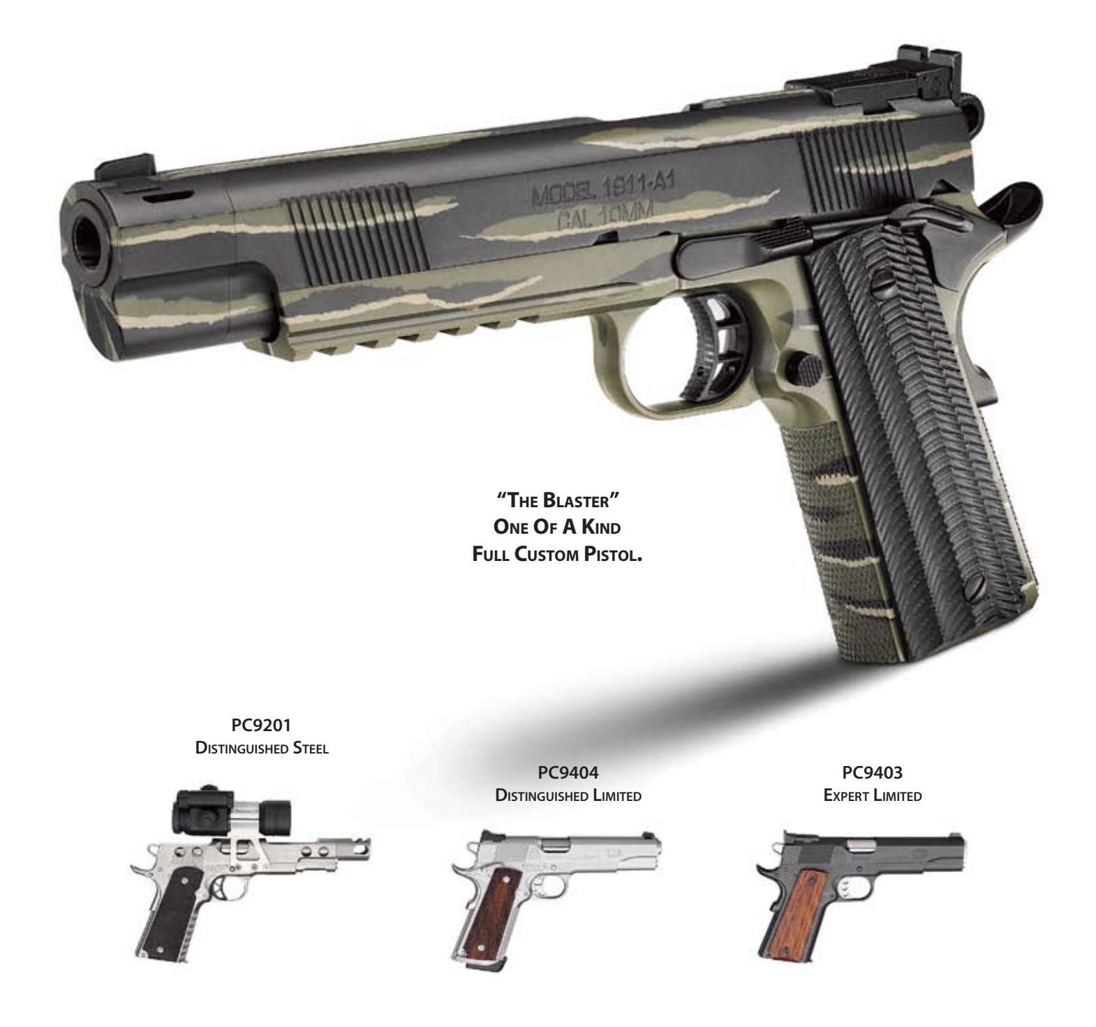
AVAILABLE IN ALL POPULAR 1911-A1 CALIBERS BUILT TO INDIVIDUAL SPECIFICATIONS.